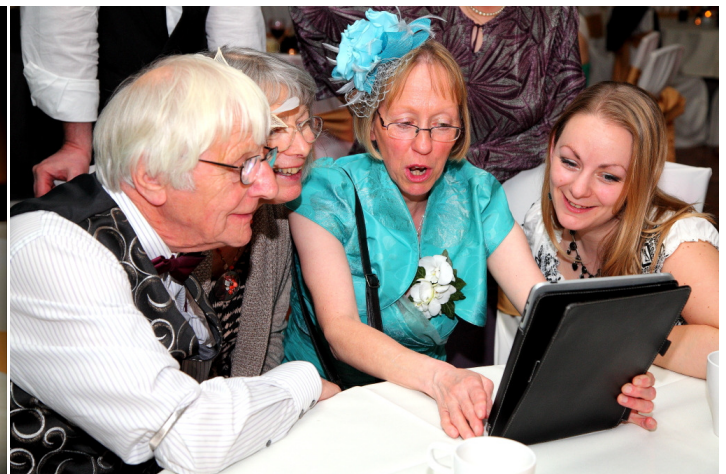
Guests enjoying the iPad Preview Gallery at the Wedding Reception.