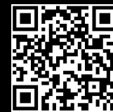
Highlight Video Demo

Add the 'Comprehensive Video' service to this package for only £500 (see page 4)