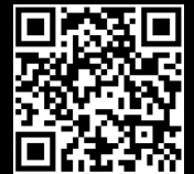
Highlight Video Demo

THIS ADDS ONLY £300 to any Photography package.